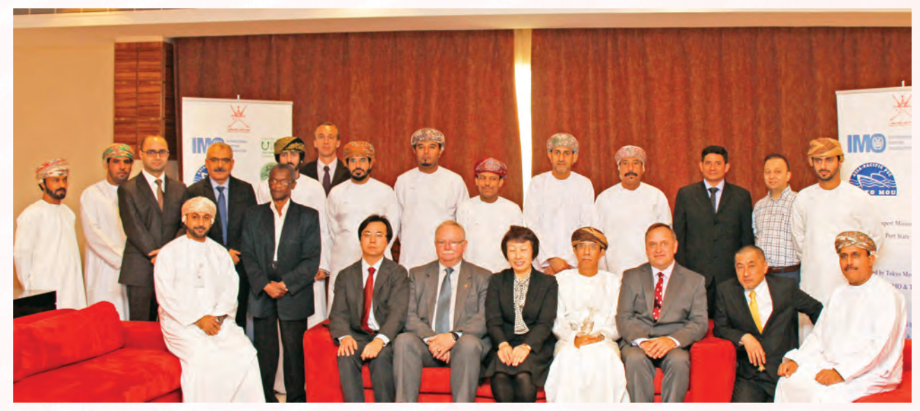
2<sup>nd</sup> EXPERT MISSION TRAINING, MUSCAT & SOHAR – SULTATNATE OF OMAN

To enhance the capabilities of the PSCO's within the Riyadh MoU Region the Secretariat organized the following training courses and workshops which were approved by the Committee members of the Riyadh MoU: